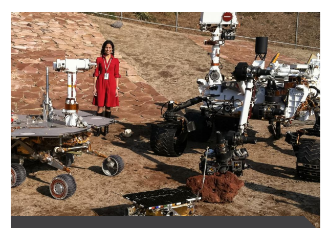
A space roboticist works with her team to drive the Curiosity rover across the surface of Mars.

Mission control staff members are critical to ensuring the success of a space mission. They coordinate the launch, flight, and landing of missions involving spacecraft, satellites, space telescopes, and rovers. They also communicate new discoveries to the public and maintain the special equipment needed to support missions. NASA staff working in mission control are responsible for the safety and success of space missions, and team members with skills in science, project management, and engineering all make important contributions.