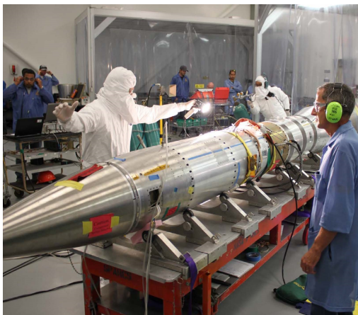
Researchers used the Hi-C science payload to study the Sun's corona.

Scientists use many different kinds of spacecraft to make new discoveries. Like satellites, weather balloons, and airplanes, sounding rockets help teams of NASA scientists and engineers put scientific instruments into space. These rockets are