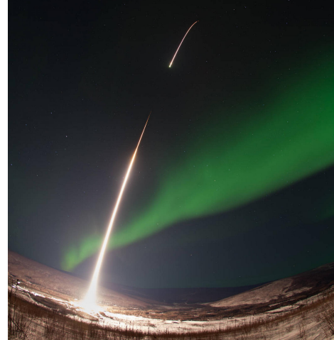
We use some sounding rockets to learn more about aurora borealis over the Arctic.

Sounding rockets follow an arc-like path into near-Earth space and then fall back under a parachute. They travel to an area of space that is too high for weather balloons, but lower than the path of most satellites.