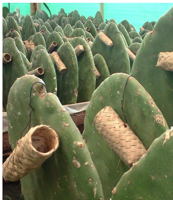
Native peoples in Central and South America have developed a highly controlled and intricate set of practices to farm and collect cochineal insects for dye.

Indigenous people, including Incas and Aztecs, in Central and South America were the first to discover ways to use cochineal bugs to make pigments that could color fabrics and other materials. This dye was once so highly prized that bags of the dried bugs were used as currency or as tribute. Spaniards, who colonized these areas, took the cochineal process back to Europe, and for a time cochineal was Mexico’s second-most valuable export after silver. Cochineal was used to dye the cloaks of Roman Catholic cardinals and to color jackets that gave British “redcoat” soldiers their nickname. Today, this rare and hard to cultivate dye is still used to color fabrics and food products around the world.