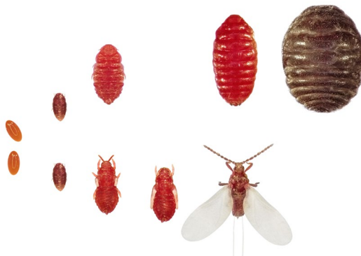
The cochineal bug ( Dactylopius coccus ) is a scale insect that lives on cactuses from the the Southwestern United States to South America.

Terms like “natural” and “artificial” on labels can be confusing. The cards show a range of products that use different ingredients to add color to food and cosmetics. Even though an ingredient like beet juice is a naturally occurring substance, it is considered an “artificial color” when added to a food deliberately for its color.