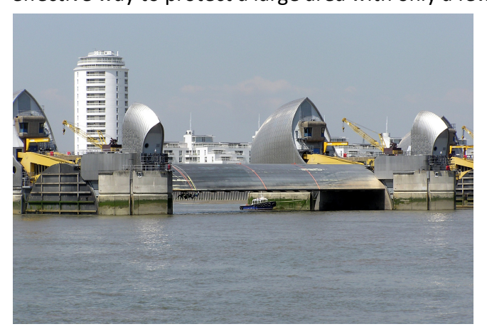
The Thames Barrier in London.

Read through this box to learn more about the Keep Water Out strategy. You will use this information during your discussions at the forum.