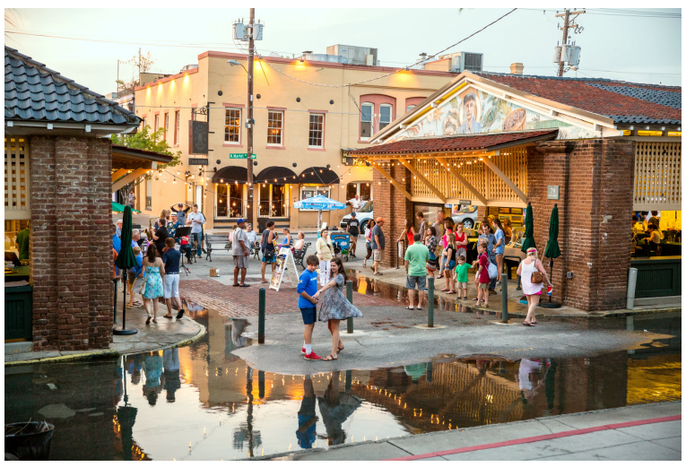
"Sunny day" tidal flooding in Charleston, SC.

Researchers from NOAA have shown that the frequency of these "sunny day" floods has increased dramatically across the Eastern and Gulf coastlines in the last halfcentury or so as sea levels have risen<sup>26</sup>. In Baltimore, for example, the average number of observed days of nuisance floods has gone from about 1 to about 13 days per year over the 50-year period between the late 1950's and the period between 2007-2013<sup>27</sup>.