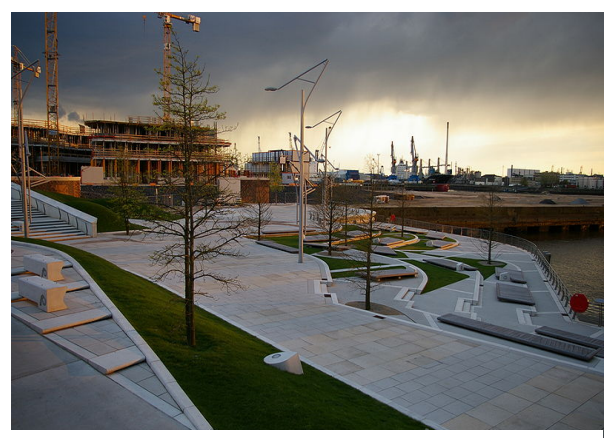
Elevated promenades in the Hafencity, Hamburg.

Read through this box to learn more about the Living with Water strategy. You will use this information during your discussions at the forum.