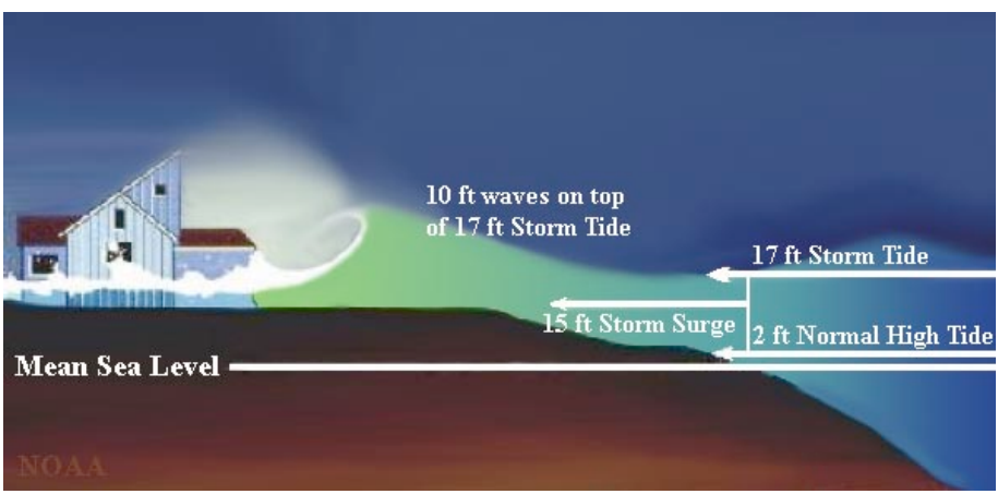
Depiction of a storm surge event on top of normal high tide event.

Storm surges and extreme precipitation events on top of sea level rise make coastal flooding concerns much more severe. When coastal storms push many feet of seawater towards the shore, the resulting storm tides can overtop structures and protections that were constructed over a century ago when the level of the sea was not as high as it is today. When storm events occur at times when astronomical tides are already high, as occurred in 2012's Superstorm Sandy in the mid-Atlantic, storm surges push huge amounts of ocean water into coastal communities. Storm surge greatly increases communities' risks of physical damage, loss of life, or of potential loss of power and communication from coastal flooding.