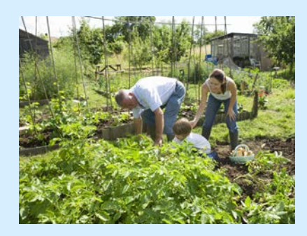
Neighbors can work together to create community gardens.

Being a change agent involves reflecting, asking questions, and taking actions, as individuals and communities. For example, we can invest time and money to make community gardens that are attractive, grow food, and provide a place for neighbors to meet each other.