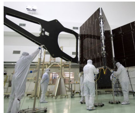
NASA crew building the Juno spacecraft.

NASA's Juno mission is studying the gas planet Jupiter and its moons. Juno is probing beneath the cloud cover to learn more about the planet's origins, structure, atmosphere, and magnetic field. At the end of the mission, Juno will purposely deorbit (crash) into Jupiter to avoid contaminating its moons with microbes from Earth. Scientists don't want Juno to impact any possible alien life—and they don't want researchers in the future to accidentally "discover" what actually came from Earth during a previous expedition!