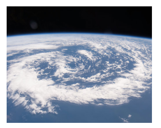
Satellites like the International Space Station view clouds from above.

This activity uses alcohol vapor (gas) rather than water vapor to make a cloud, but it forms in the same way. By increasing the pressure inside the bottle, you also increase the temperature. When you release the pressure, the temperature drops, causing the vapor to condense into very small droplets you can see.