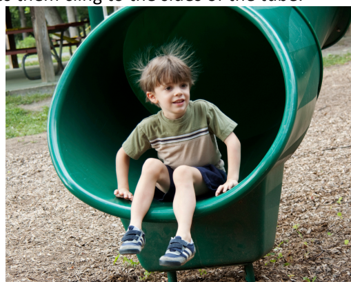
Static electricity builds up on slides

You also see static electricity at work when your hair stands on end after you pull off a fleece, or when you get a shock after walking across a carpet.