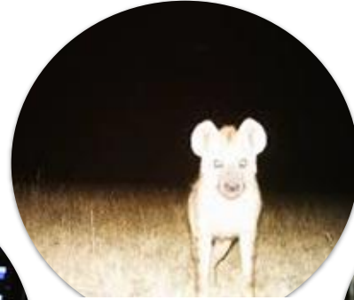
Spot Animals in Camera Traps