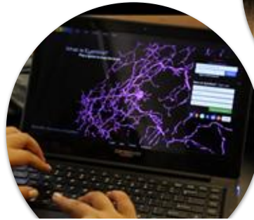
Play Online Games to Help NASA Scientists