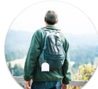
Share Air Quality Observations