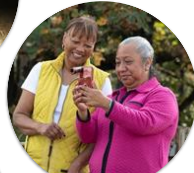
Upload Pictures of Nature