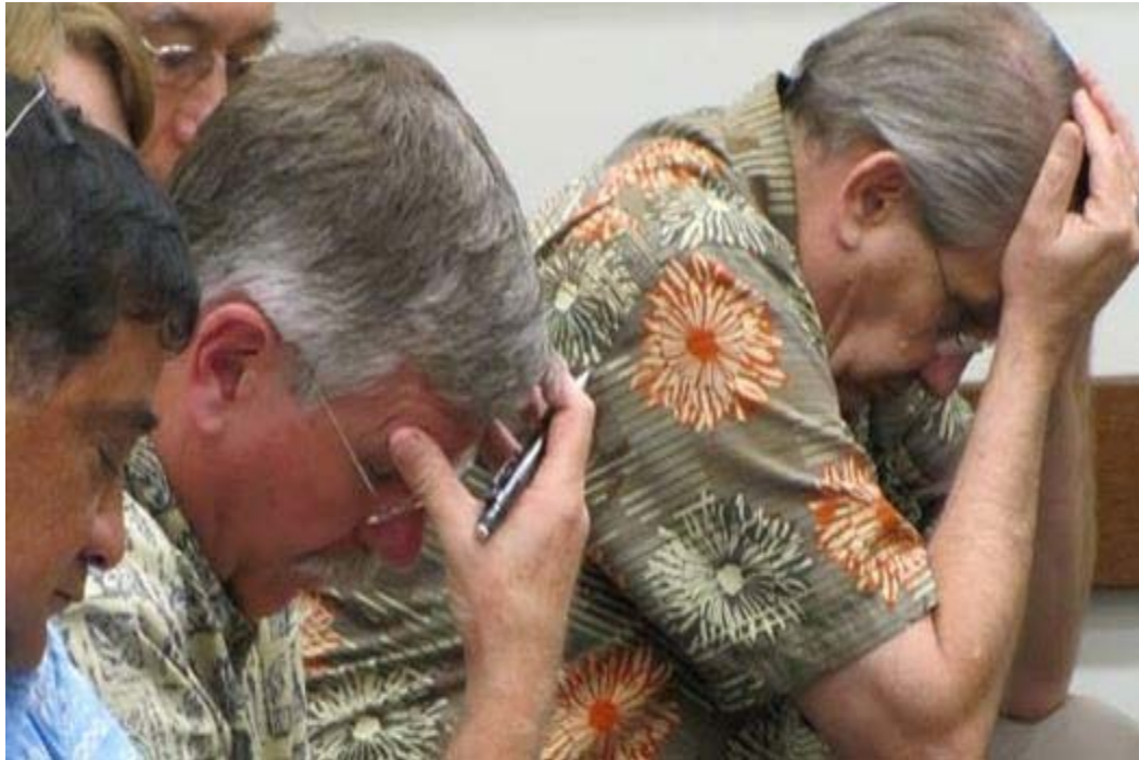
Hilo Herald Tribune Image