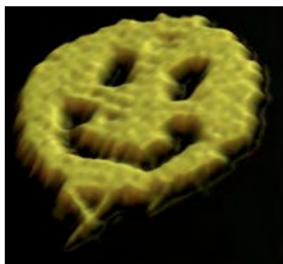
Smiley face made of DNA 100 nm wide

Self-assembly is a process by which molecules and cells form themselves into functional structures. Self-assembly occurs in nature—snowflakes, soap bubbles, and DNA are just three examples of things that build themselves.